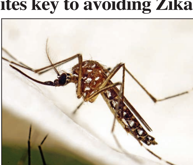
This is an Aedes aegypti female, one of the mosquito species capable of carrying the Zika virus.