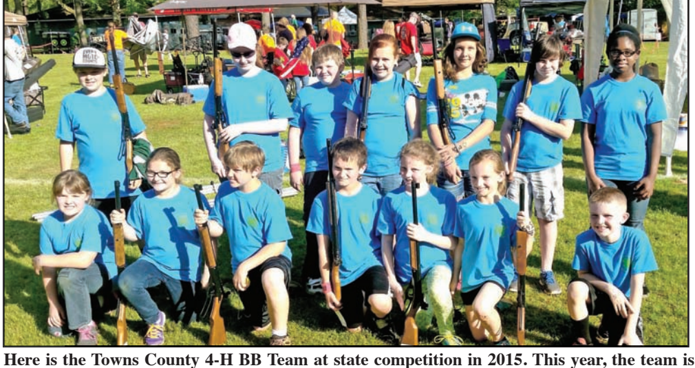
seeking local support to create care packages for local troops overseas.

"So, for our first 4-H project of the year, the fourth- and fifth-