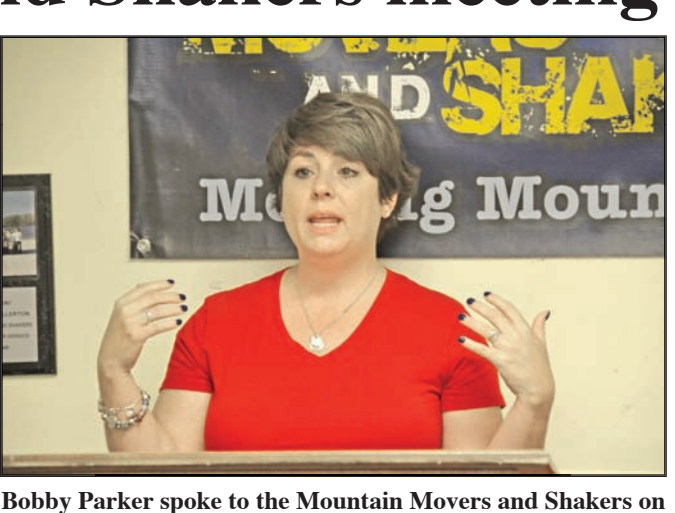
Friday, Aug. 26 about programs available at the Towns County Senior Center

the care of such facilities are unaware of the economic impact it can have on personal assets due to the cost. While most people assume a nursing home would be covered by insurance, there are many cases where it is not due to specifications within